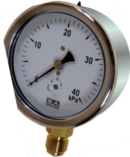
For dimensional drawing see technical section

Calibration Certificate Customized scale plates ( customer logo, red line, etc ) Special Dials, other than standard ( dual scale, bar, psi ) Colour Coding of dial Blow out disc